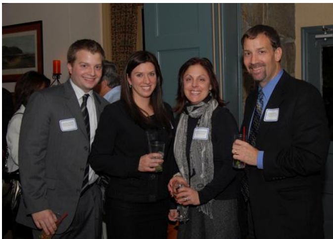
November Business Card Exchange at Club House Café at Glen Brook Golf Club

The November Business Card Exchange was held at the Club House Cafe at Glenbrook Golf Club. Even with the large crowd, everyone had the opportunity to network and enjoy the delicious array of food that was served. This historic building is the perfect place to enjoy a delicious dinner in their dining room, where you can view the beautiful fairways. For more information contact them today at 570-421-6081.