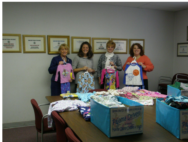
Annual Pajama Drive

The Greater Pocono Chamber of Commerce Quality of Life Committee held a Pajama Drive to benefit Monroe County Children and Youth. There was over fifteen chamber members that had drop off locations throughout Monroe County. The Pajama Drive started the first week of October and ran for the entire month with a final count of 98 brand new pajamas from newborn to size 18. On Thursday, November 12, 2009, the Quality of Life Committee presented the pajamas to Monroe County Children and Youth which is located at 730 Phillips Street, Stroudsburg, PA.